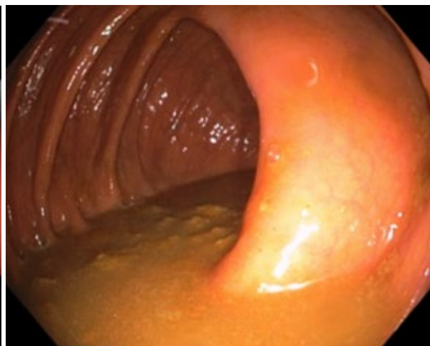
POOR COLONOSCOPY PREP