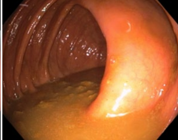
POOR COLONOSCOPY PREP