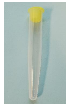
Urine Conical Lawson order number Conical 063240 Caps 061974