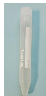
RLC30 – Med Tox