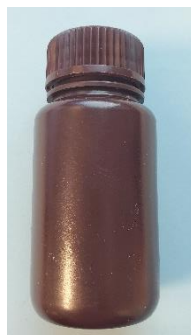
Referrals – light protect