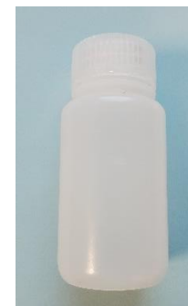
Referrals Order through Client supply