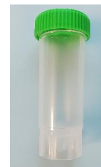
RLC70– Green Top