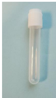
Aliquot Transfer Tube Lawson order number 004411