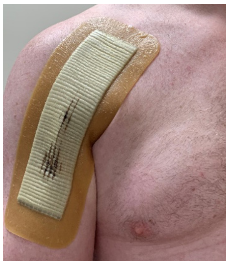
Dressing does not need to be changed.