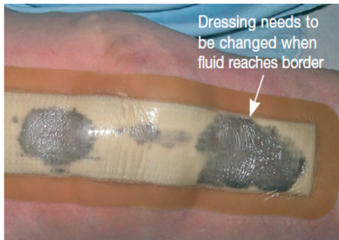
Dressing needs to be changed.