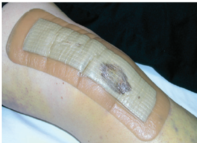
Acceptable amount of fluid.