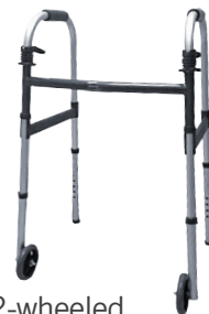
2-wheeled front rolling walker